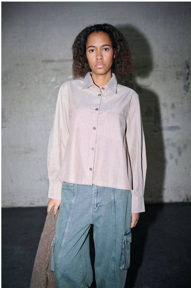
01 LavinaHBS Shirt 02 LakeHBS Pants