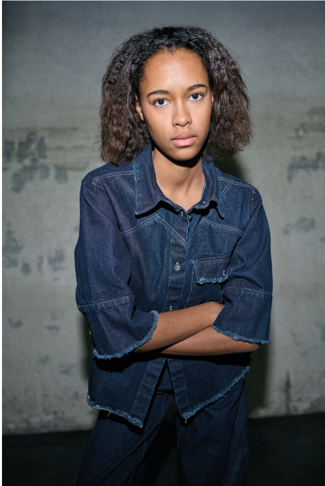
01 LeslieHBS Shirt 02 LeslieHBS Pants