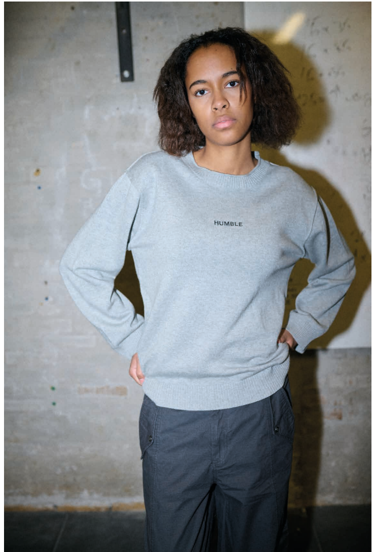
01 JazzHBS Pullover 02 LuzHBS Pants