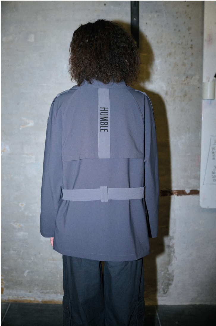
01 LuccaHBS Jacket 02 LuzHBS Pants