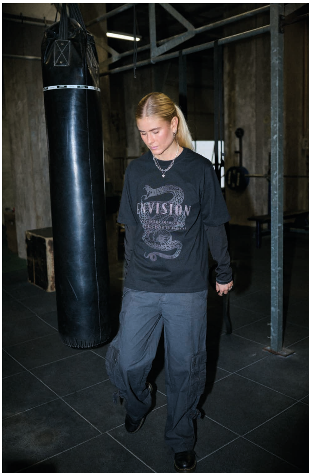
01 LulluHBS Tee 02 HeatherHBS Long Sleeve 03 LuzHBS Pants