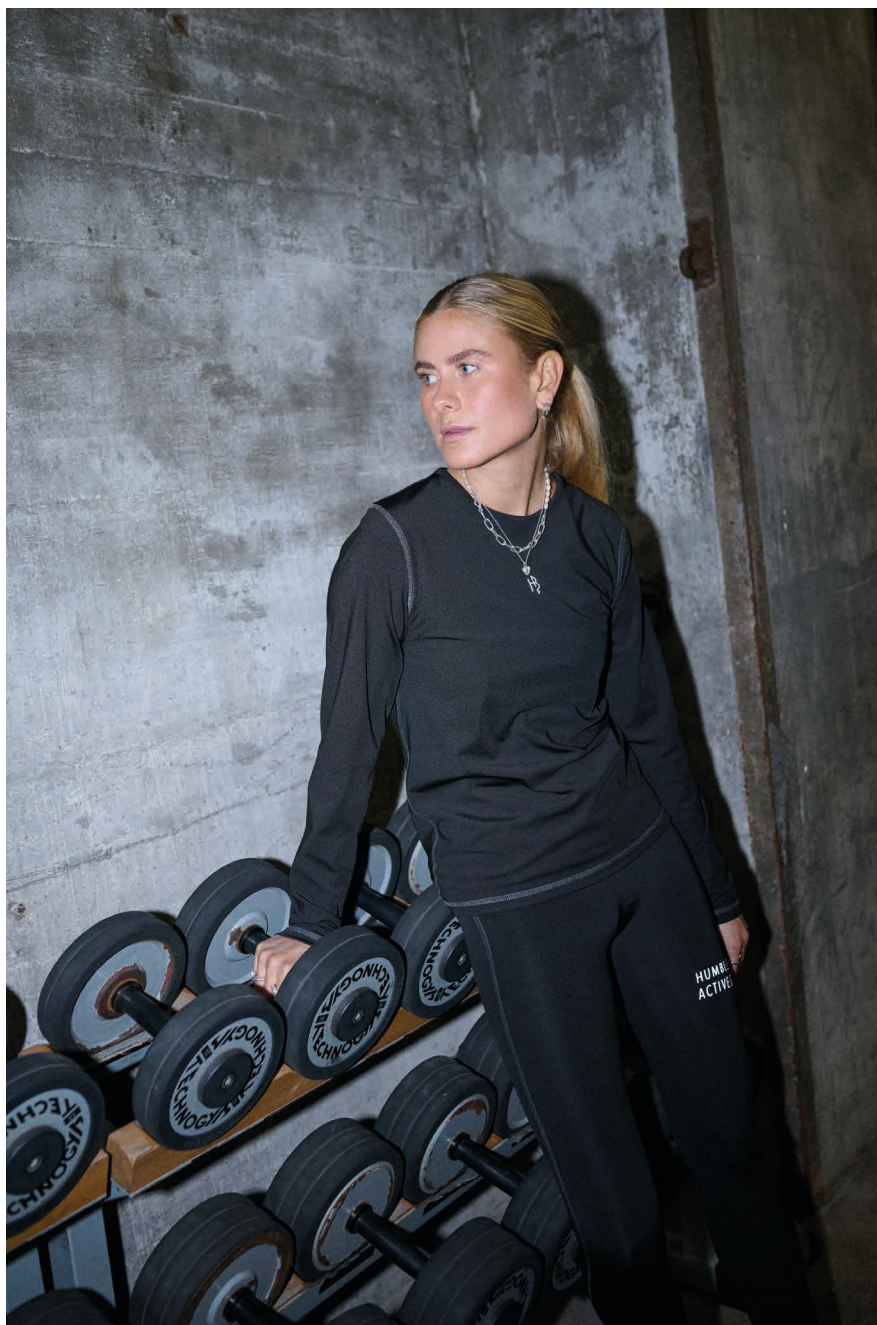
01 HeatherHBS Long Sleeve 02 HeatherHBS Tights