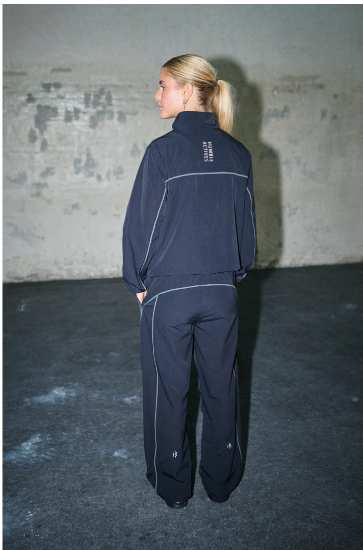
01 LaneHBS Jacket 02 LaneHBS Pants