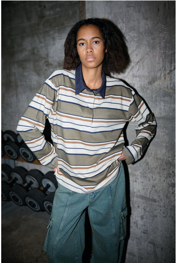
01 LauraHBS Polo Sweat 02 LakeHBS Pants