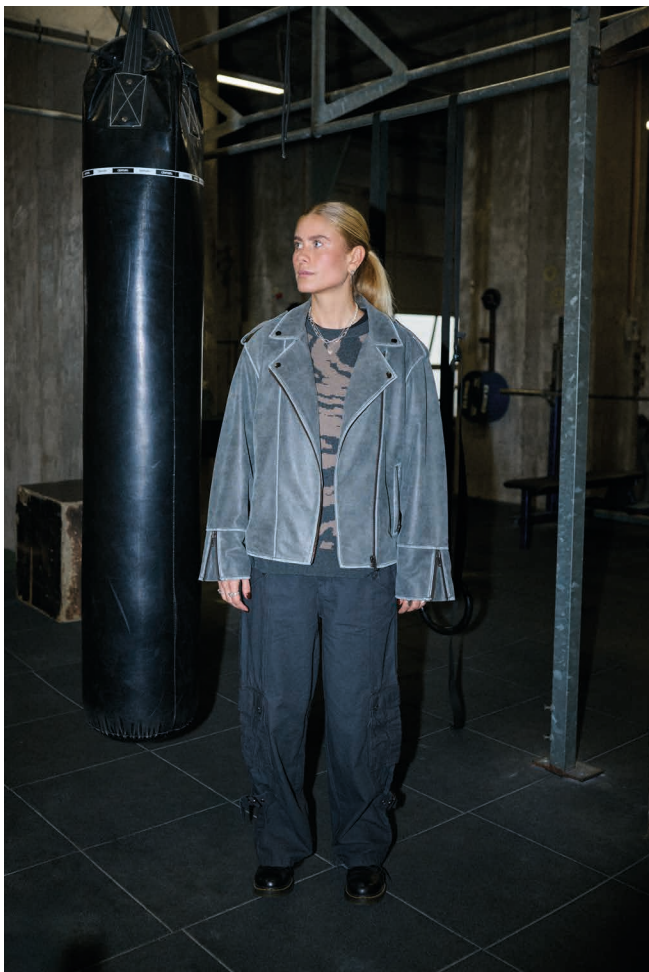
01 LegacyHBS Jacket 02 LolaHBS Pullover 03 LuzHBS Pants