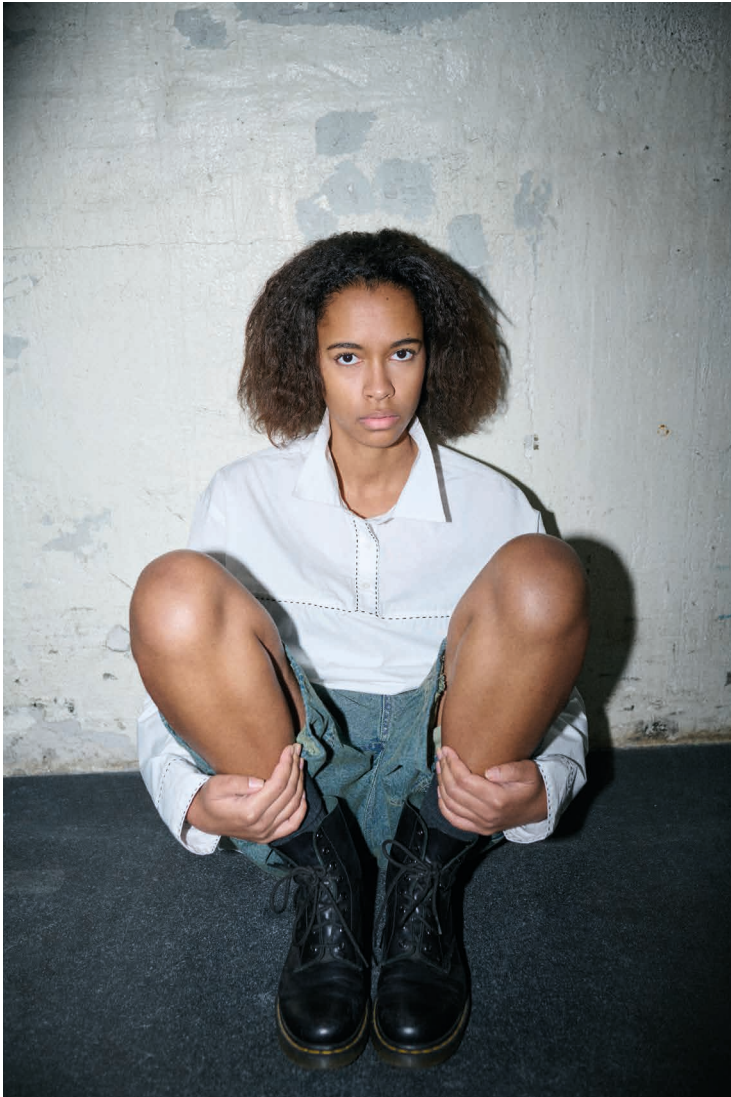
01 LucciHBS Shirt 02 LakeHBS Bermuda