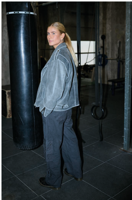
01 LegacyHBS Jacket 02 LuzHBS Pants