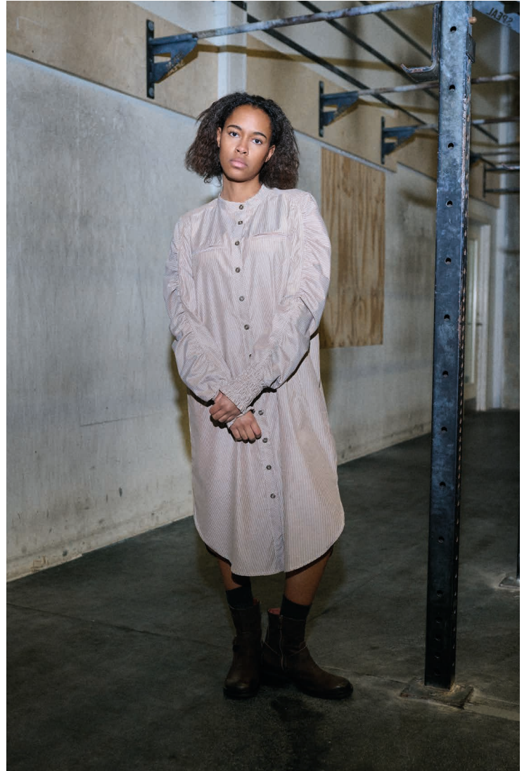
01 LavinaHBS Dress