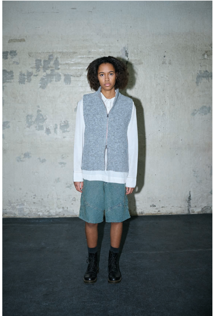
01 LutusHBS Vest 02 LucciHBS Shirt 03 LakeHBS Bermuda