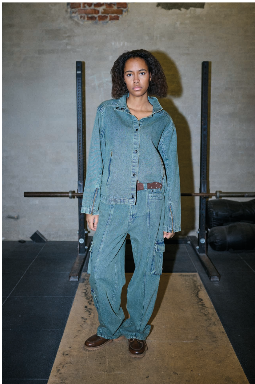
01 LakeHBS Jacket 02 LakeHBS Pants 03 LarisaHBS Belt