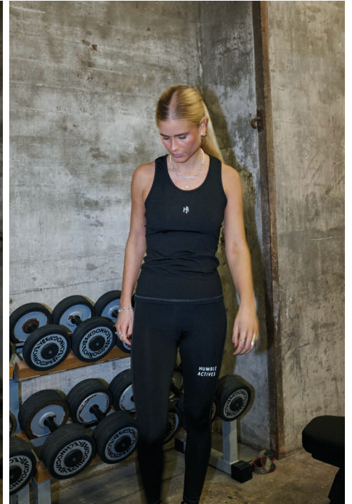
01 HeatherHBS Top 02 HeatherHBS Tights