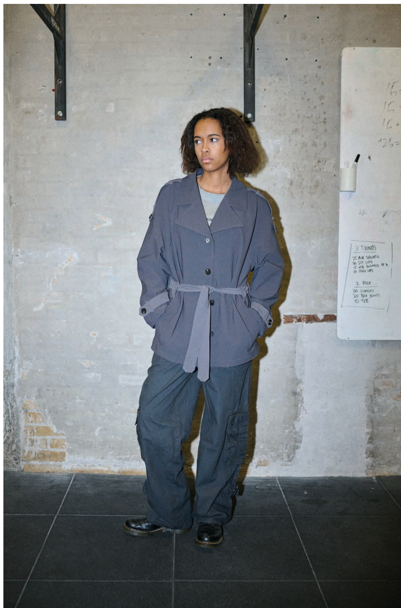
01 LuccaHBS Jacket 02 JazzHBS Pullover 03 LuzHBS Pants