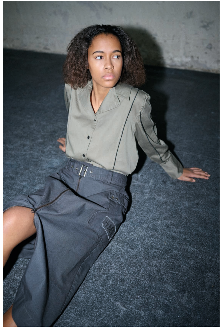
01 LiviaHBS Shirt 02 LuzHBS Skirt