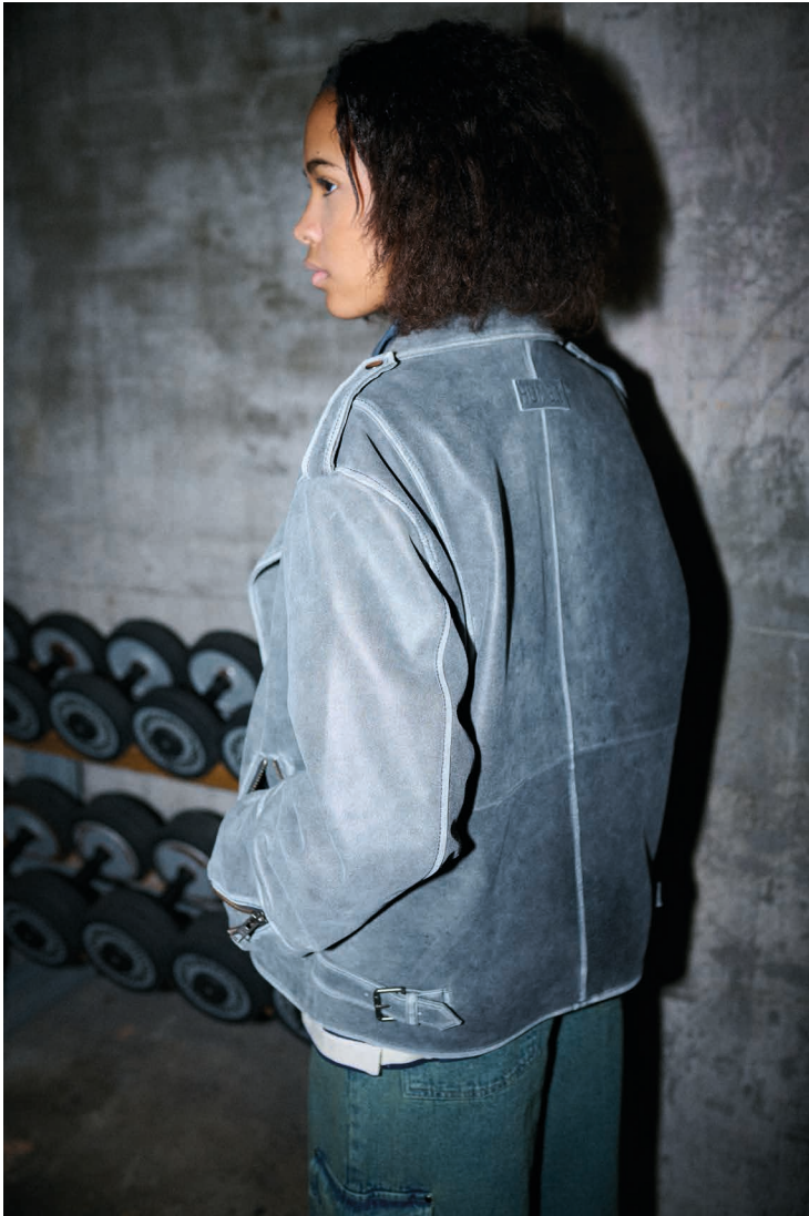
01 LegacyHBS Jacket