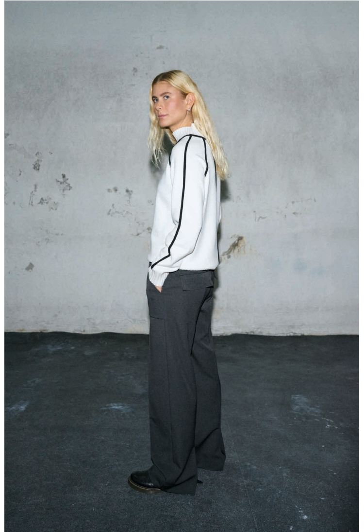
01 LivHBS Pullover 02 LindseyHBS Pants