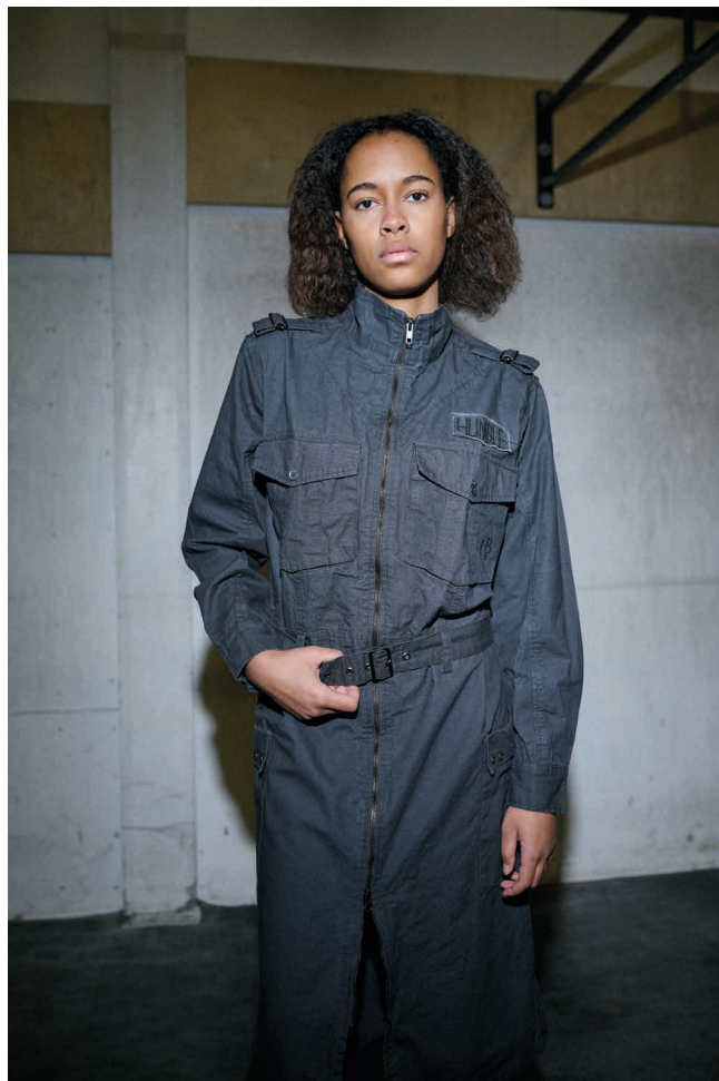
01 LuzHBS Dress