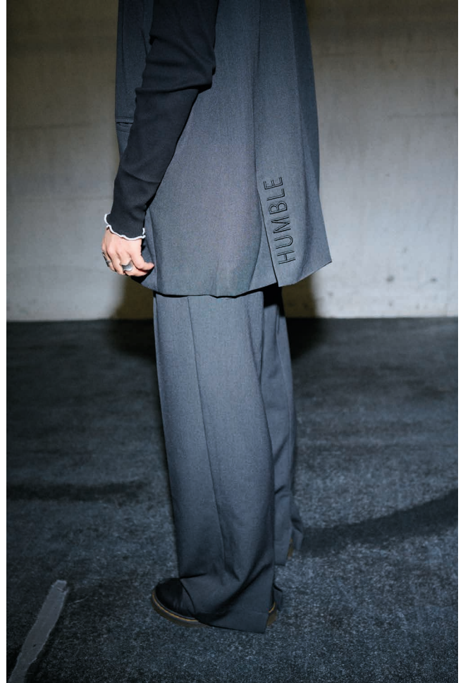
01 LindseyHBS Vest 02 LenoraHBS Long Sleeve 03 LindseyHBS Pants