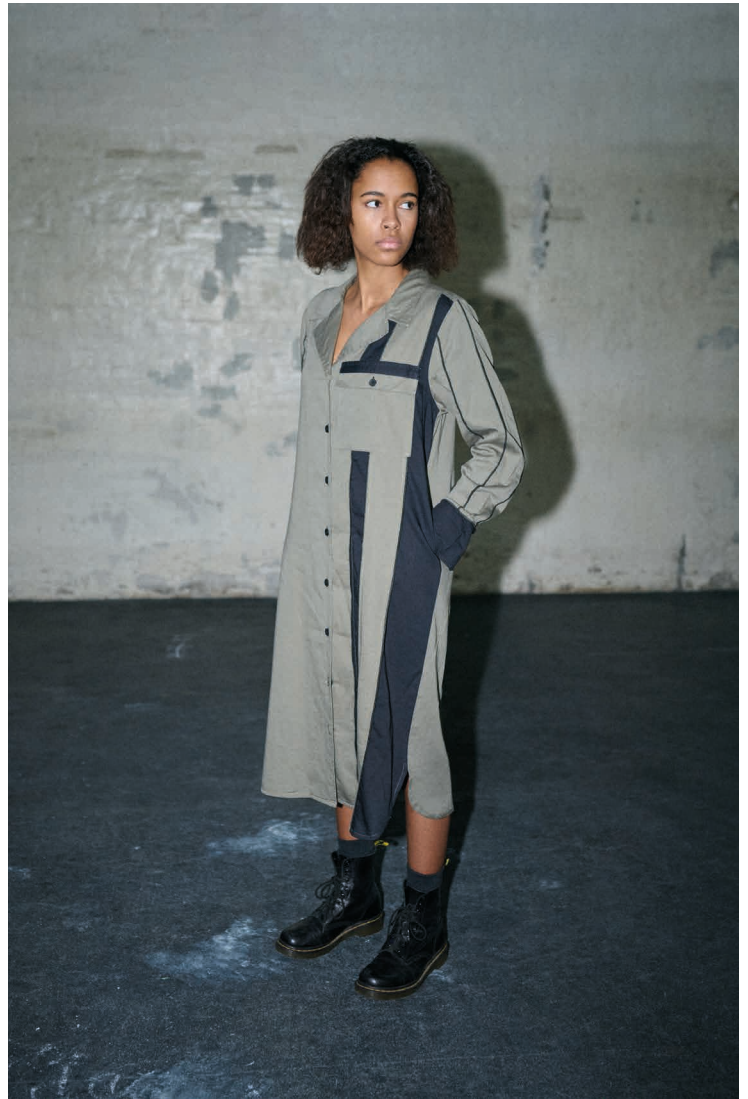
01 LiviaHBS Dress