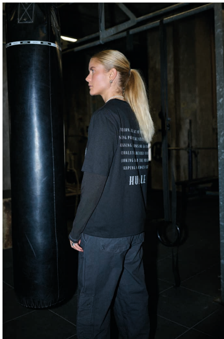
01 LulluHBS Tee 02 HeatherHBS Long Sleeve 03 LuzHBS Pants