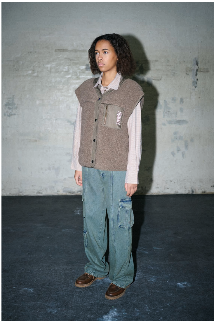
01 LouHBS Vest 02 LavinaHBS Shirt 03 LakeHBS Pants